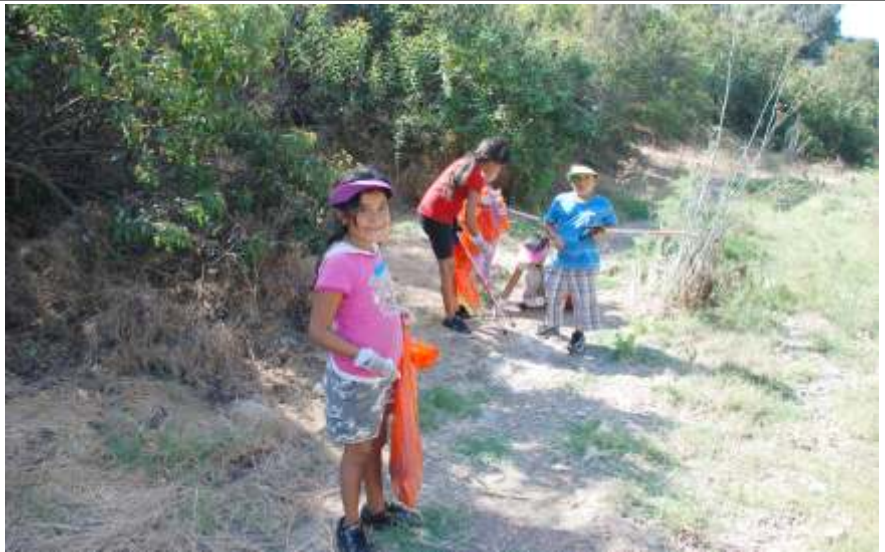
Young South Castle volunteers pick up litter in Manzanita Canyon

Many thanks to the 61 volunteers who made our September 19 I Love a Clean San Diego California Coastal Cleanup Day a big success. Thirty-one volunteers chainsawed, loppered, hauled, chipped and raked the dead brush and invasives at our Canyon Fire Safety Demonstration project on the rim of Manzanita Canyon. Special thanks to San Diego Canyonlands and Firebreak Solutions for the technical advice on the invasives to take out and how much to trim the various kinds of native vegetation. We are deeply indebted to Alpine Equipment Rentals for donating a chipper to the project. Fernando Gonzales of Casa Builders was able to get the chipper donated and he also delivered and returned it. All trimmings were chipped up and spread over the areas that were weed whacked.